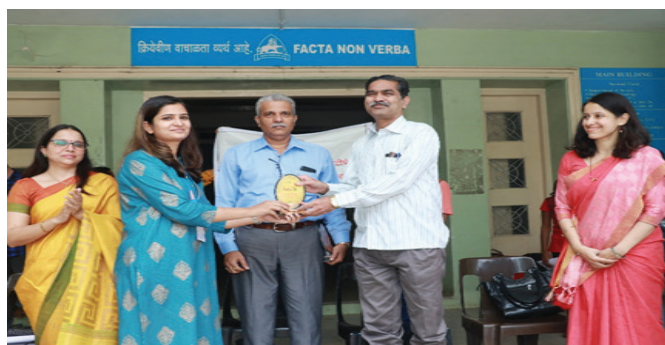
Principal felicitated guests