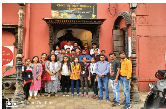
Students during the Visit to Raja Dinkar Kelkar Museum