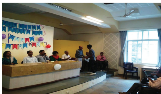
Teacher's day celebration