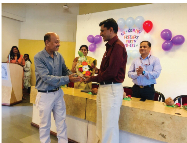
Inaugural Function of Geography Association