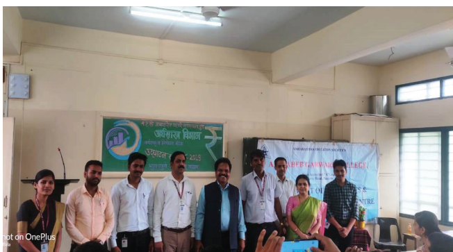
Inauguration program of Economics Association