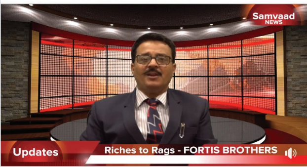
Experimental Television News Bulletin