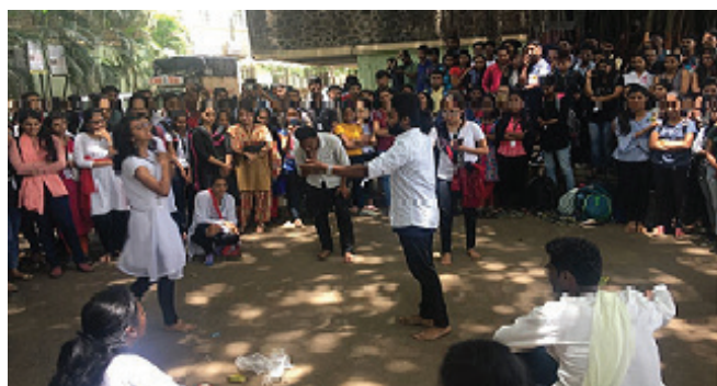
Street play by M.Sc. I students