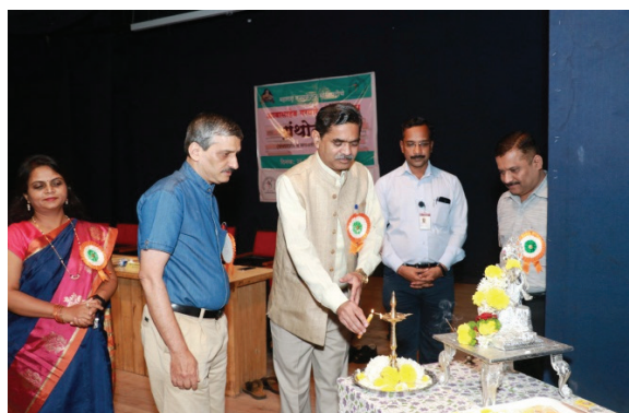
Inauguration function of Granthostav