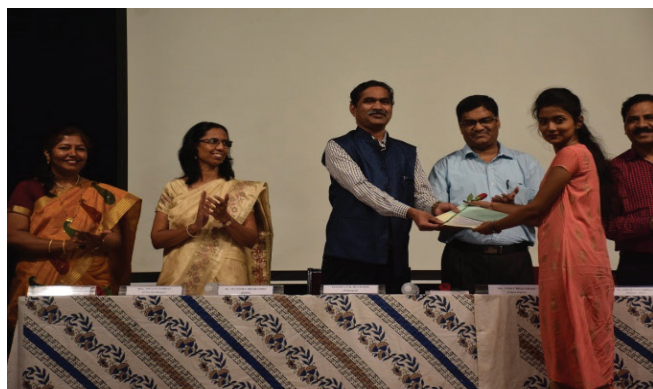
Inaugural Function of Computer Science Association