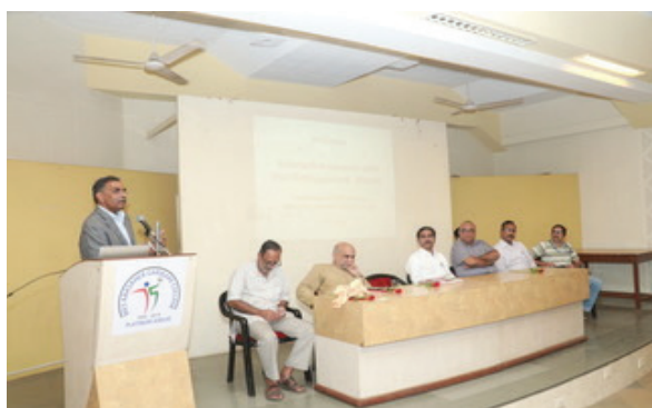
Interactive session of the distinguished alumni