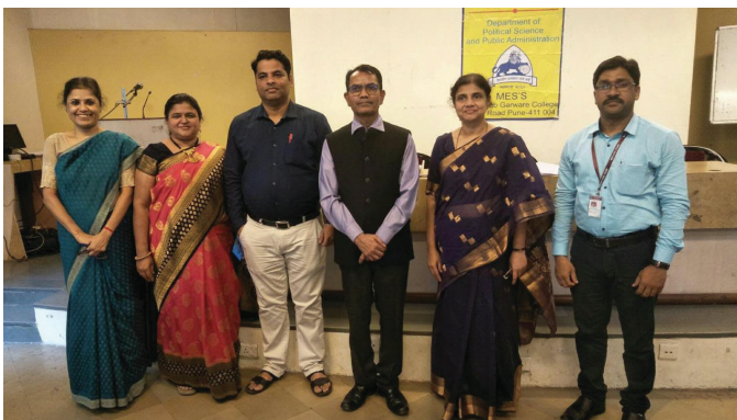
Guest and Faculty during two day workshop on Competitive Examination