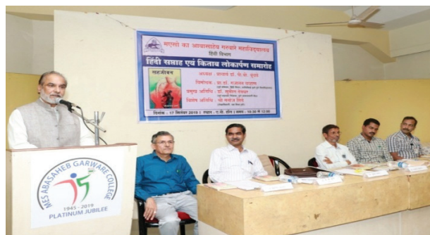
हिंदी सप्ताह तथा किताब लोकार्पण समारोह