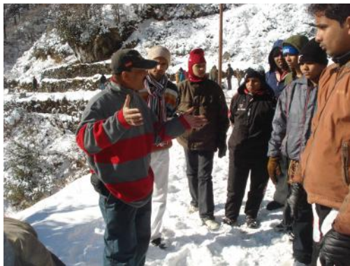
Department of Geography in North-East India