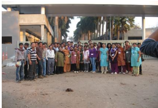
Chemistry Department at Sudarshan Chemicals (Roha)