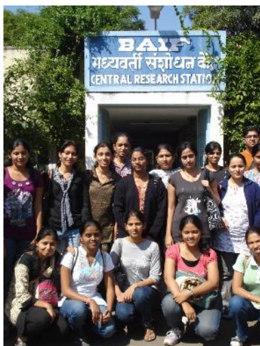
Biotechnology Department at the Bharatiya Agro Industries Foundation (BAIF), near Pune