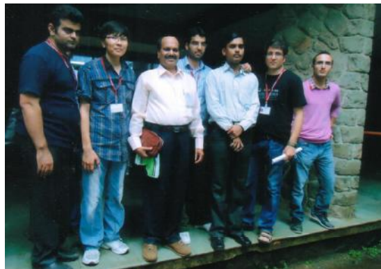
Department of Political Science at Tata Institute of Social Sciences (Mumbai)