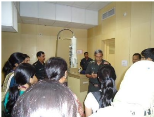
Microbiology Department visit to the Armed Forces Medical College, Pune (Electron Microscope)