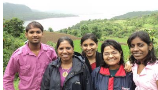
Botany Department near Dapoli (Western Ghats)