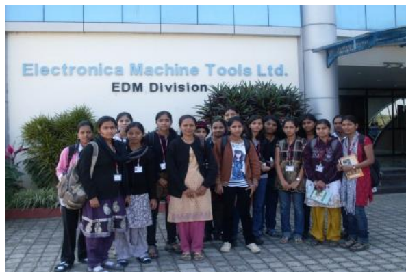
Department of Electronic Science at an Electronic Equipment manufacturing unit.